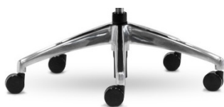
Optional Polished Aluminium Base