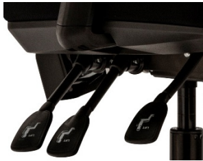
3 Lever Extreme ERGO Mechanism – Independent Seat Angle & Back Angle Tilt