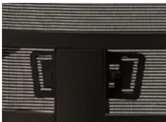
Lumbar Support (Standard)