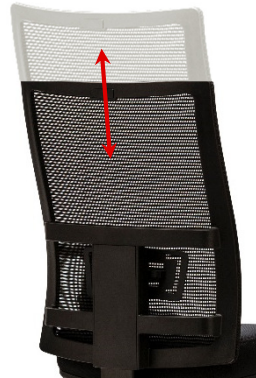
EASY-Adjust Ratchet Back Height Adjustment