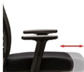
Seat Depth Adjustment (optional)