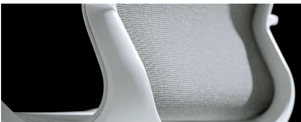
'Soft Touch' Fabric Mesh