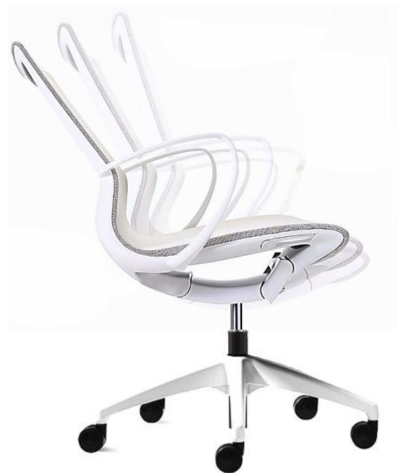
Weight Activated Auto-Balance Mechanism