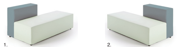
Double Seat, with Single Low Back 1. RHS when seated 2. LHS when seated